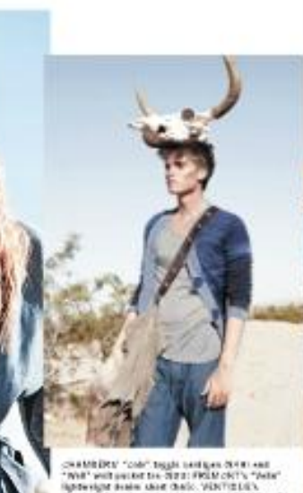
CHARMIDEY's "Goli" thigh bag ($48) and "NVR" vest and skirt ($22). FROM OBT's "NVR" lightweight denim skirt ($40). VENTURE's "Rebecca" tan hula bag ($33). CHERRY BLOSSOM's "The Blackest of Red Fall" ($22)