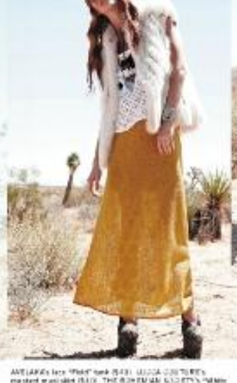
AVANTAGE's lace "Pink" tank ($43). LILICA CLOUTIER's mustard mules ($40). THE BURNHAM SOCIETY's "NVR" "Rabbit" extended storage fox vest ($300). AVANTAGE's aspened mules ($52 to $54). KELLY CYRUS's turquoise band wrap ($125) and bracelet (see p. 103). GASCONE SLAMBO's beanie platform (sell for pricing).