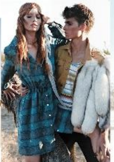
Left: ABE JAY's "Cock" hat with antlers ($150). Right: T FOR ALL MANKIND's jean (seen in "Sweet Girl" ($104). BLOOM's waltzers "Bee" tank ($19.99). CHAMBERS' "NVR" dry-washed denim (see p. 103). GASCONE SLAMBO's floral accessory (sell for pricing)