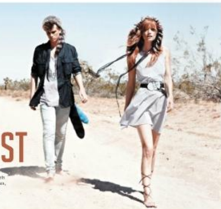
FUTURE HERITAGE's army colors "Eagle Tank" ($21) and "Decade" jean ($79). GASCONE SLAMBO's silver ballet sneakers (sell for $299 mark). BEST: KYLEE L'ORNE's Plogman turquoise hoodie and hat ($2,300). NORMA JEANE's beanie beanieless (see p. 104)