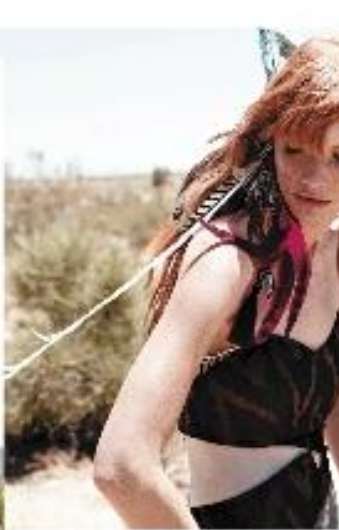
Left: PULVER's latex dress hoodie ($27) and high-waist skirt (sell for pricing). Right: BIE's white corset tank ($12). JOE MORTON's "Message" SLAMBO's beaded skirt (sell for pricing). NORMA JEANE's hat