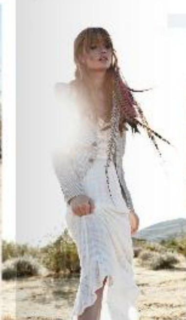
EVER's "Wave" striped blazer ($132). SHARL LIT's "Pink Lee" maxi dress ($79). GASCONE SLAMBO's feather vesting (sell for pricing)